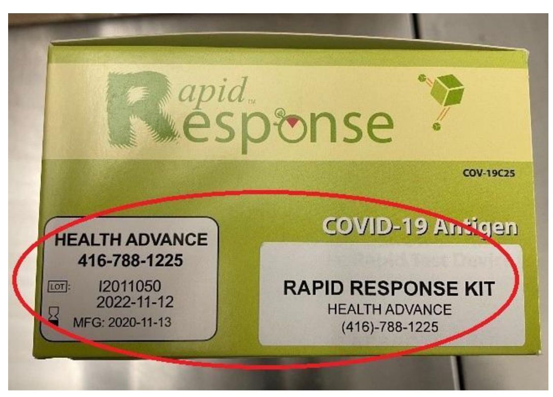
The company name and phone number appear on the side of the box is "Health Advance".